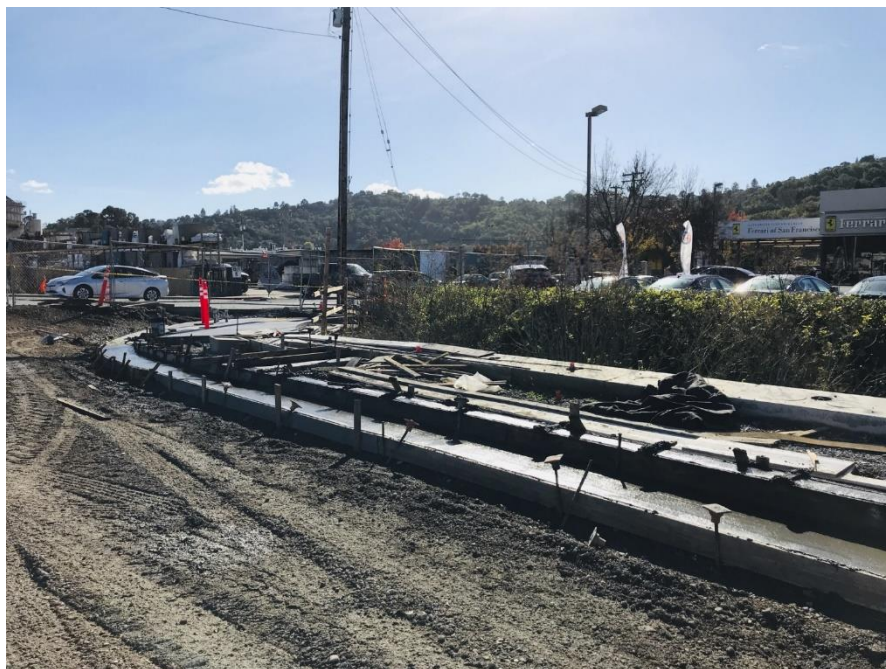
New curb, gutter and sidewalk along the new Francisco Boulevard West.