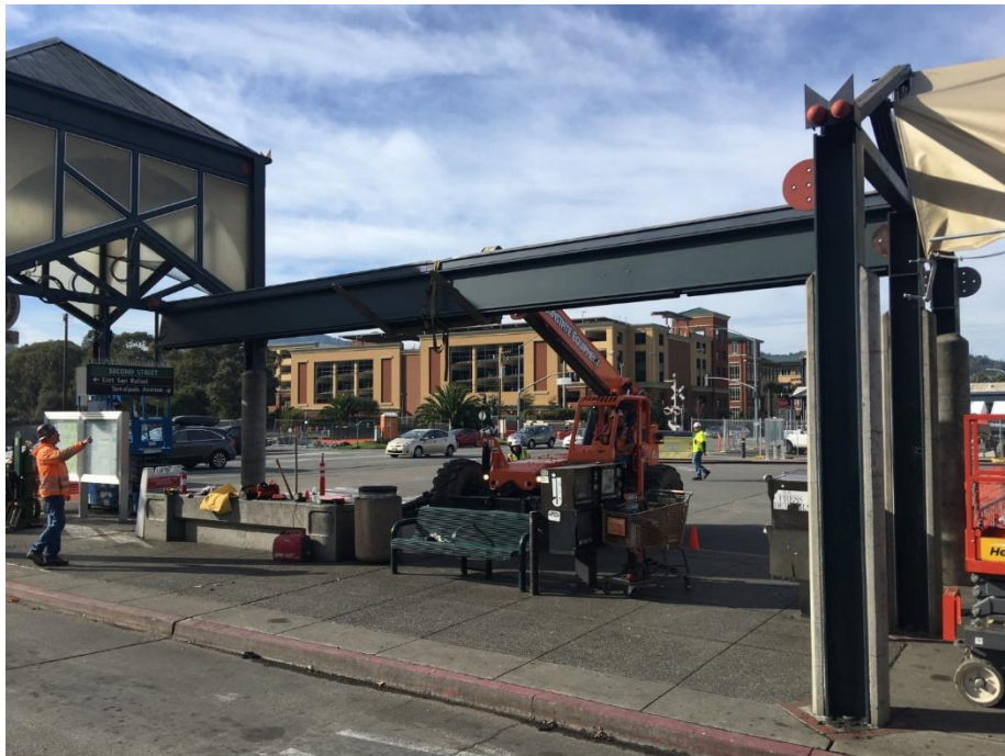
Dis-assembling a shelter at the Bettini Transit Center.