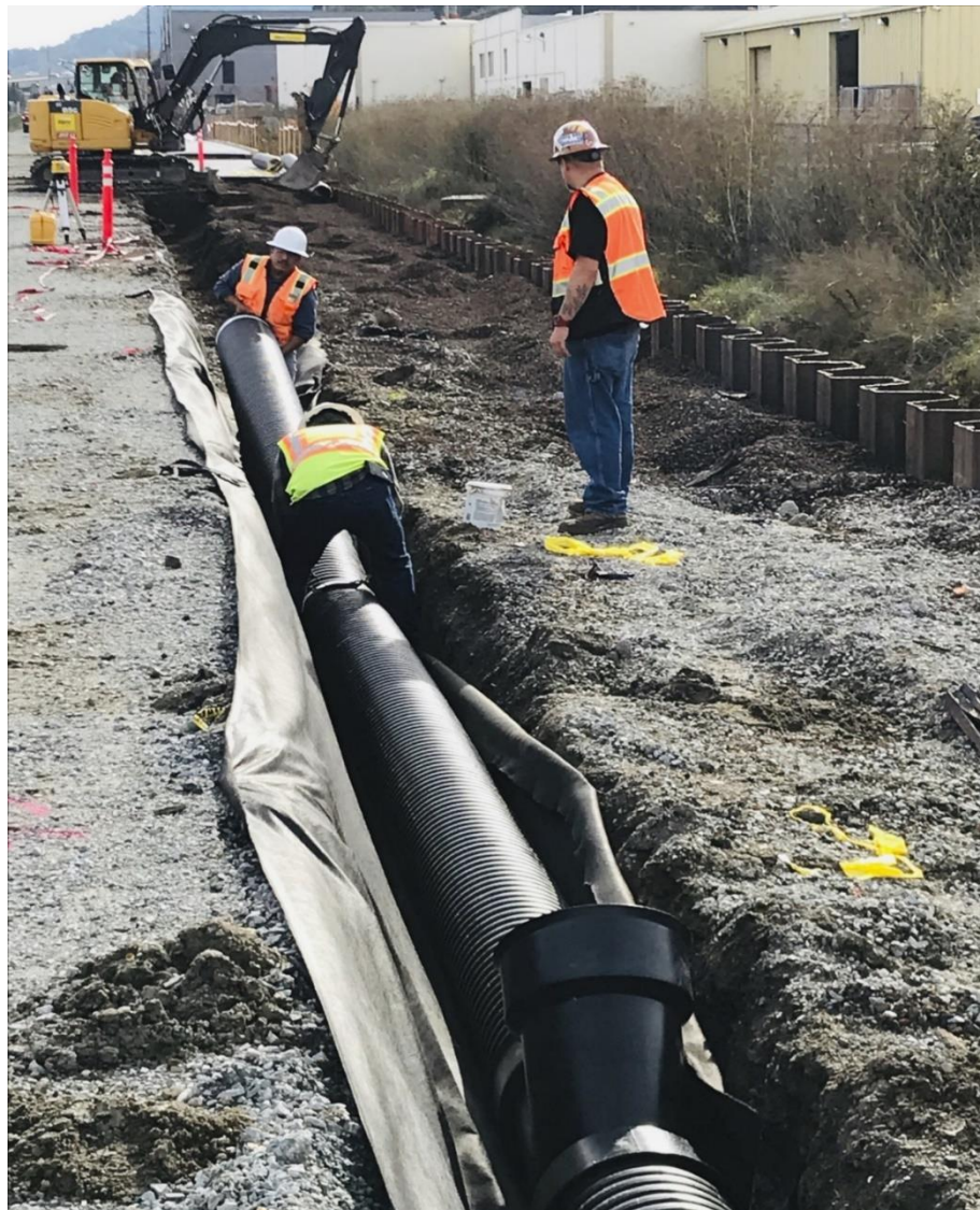
Installing 12" underdrain pipe between the track and the multi-use pathway.