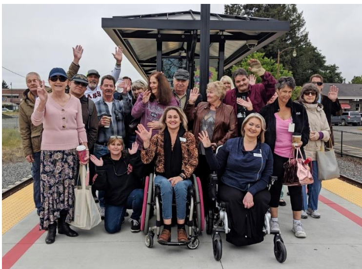
SMART passengers from the Disability Services and Legal Center in Santa Rosa gear up for a group trip following a platform safety briefing from SMART's outreach team. The platform safety briefings are a new safety program created this year to introduce new riders to SMART and railroad safety.

With the success of SMART's train service, a new safety program was introduced for large groups traveling on the train. SMART's outreach team helps these groups navigate the fare system, and provides an on-platform safety briefing prior to their trip to help ensure a smooth and safe experience. In 2018, 31 platform safety briefings were conducted, providing 965 passengers —including children, seniors and people with disabilities—with an introduction to the SMART train and important railroad safety information. This new program continues to grow and provides an excellent way to introduce new riders to the SMART train.