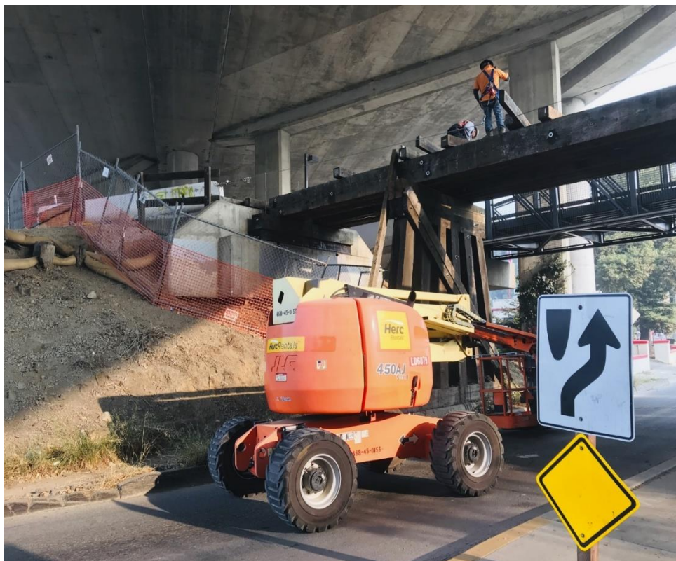
Installing deck timbers at the Auburn Street Trestle.