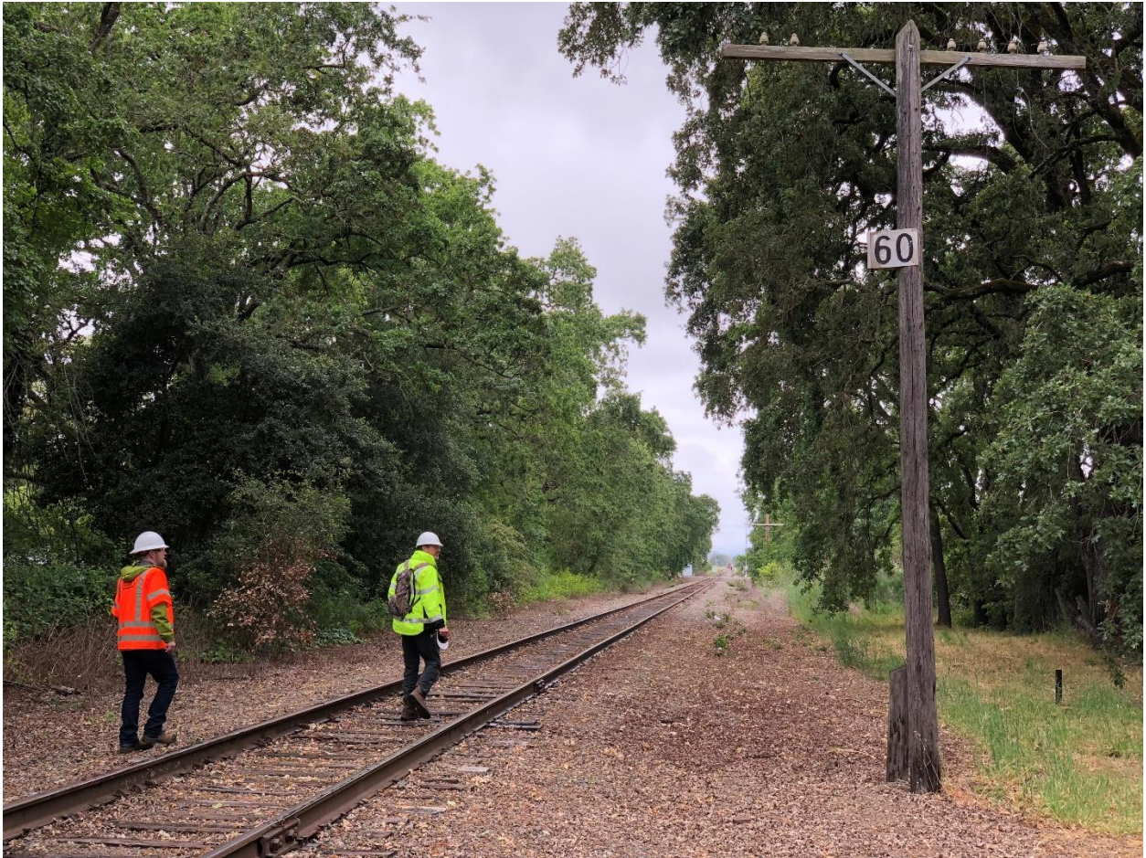
Conducting Field Surveys