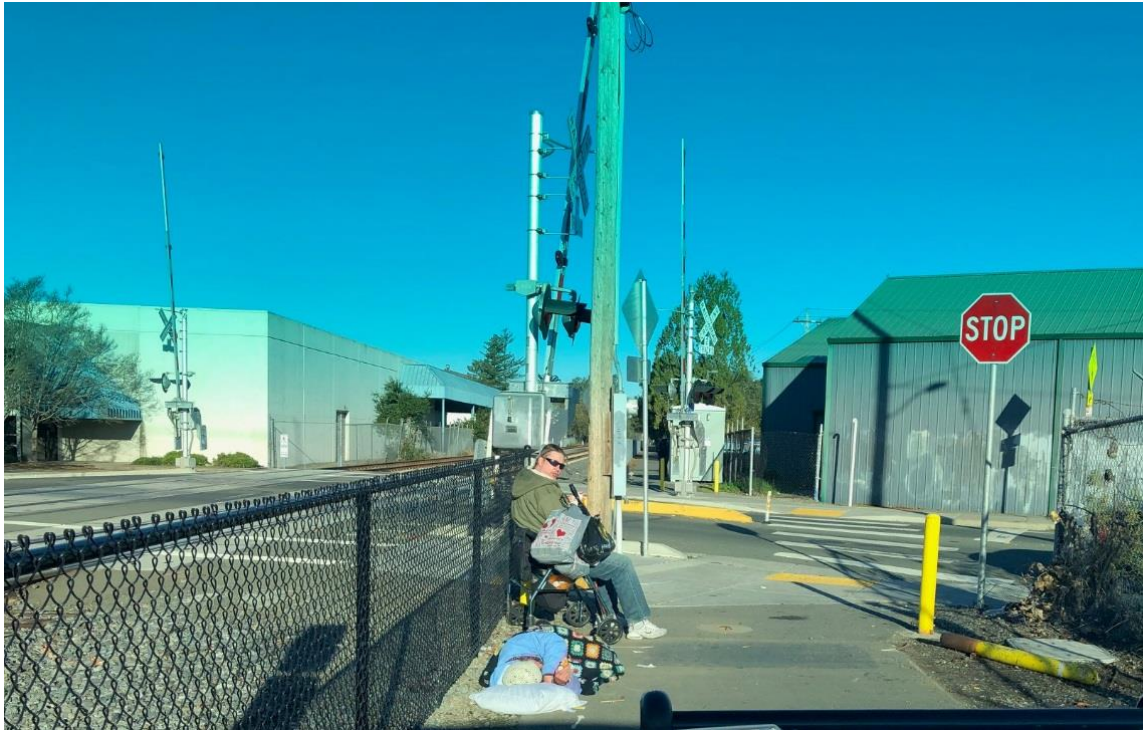
Another pathway concern with homeless sleeping in Santa Rosa. The subjects were asked to move along and relocate.