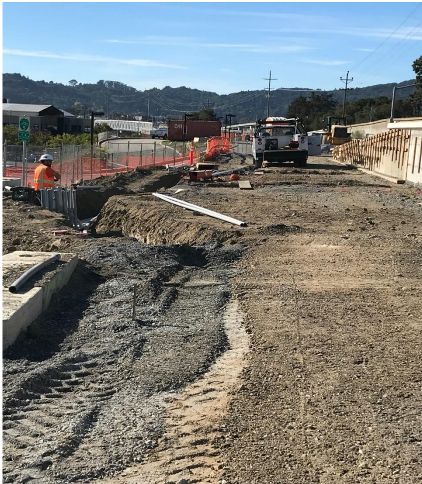
Systems duct bank installation at the Larkspur Station.