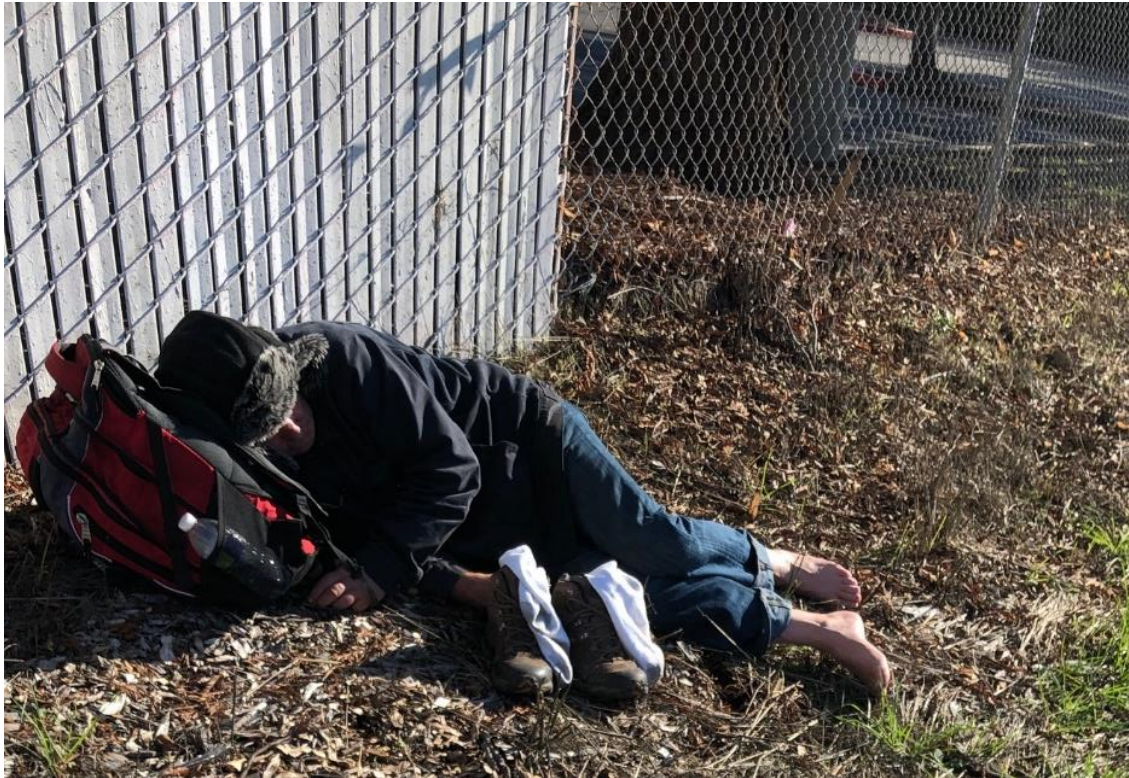
Trespasser sleeping in right of way near 3 rd Street in Santa Rosa.