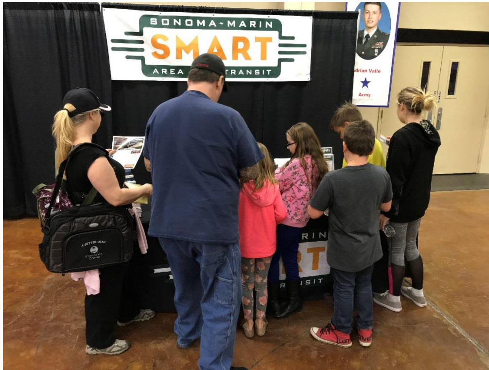
A family finds something for all ages when learning about SMART