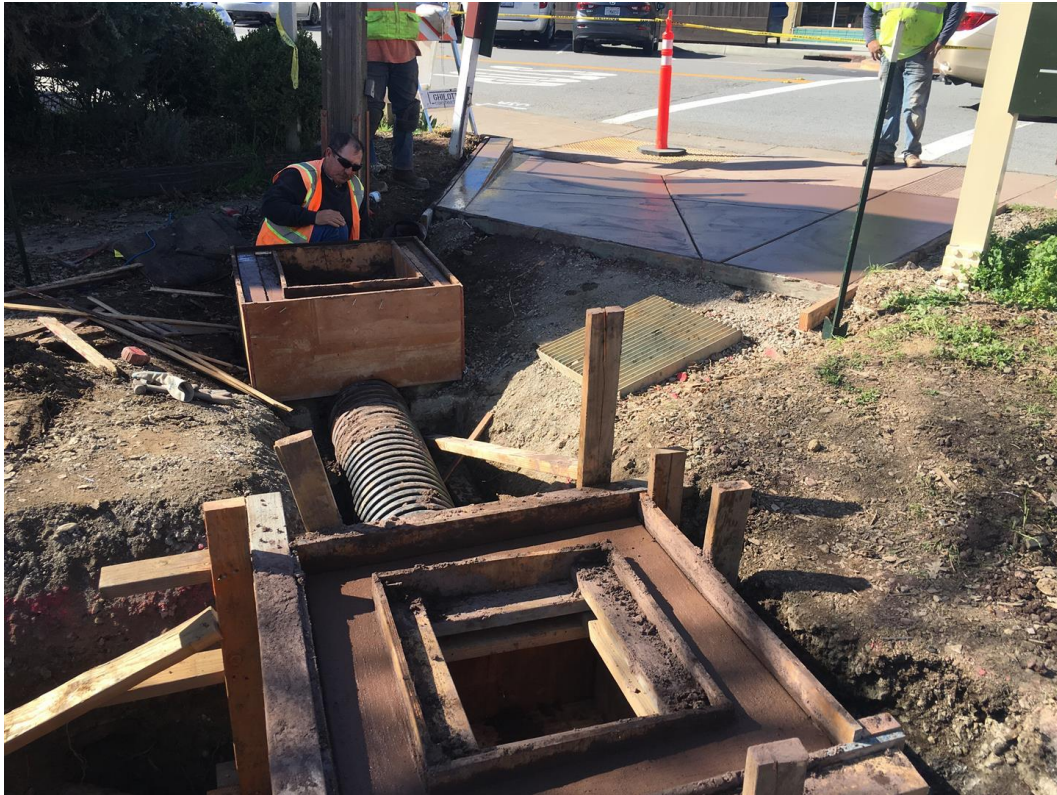
Drainage features being installed for the pathway from Franklin to Grant Avenue, Novato