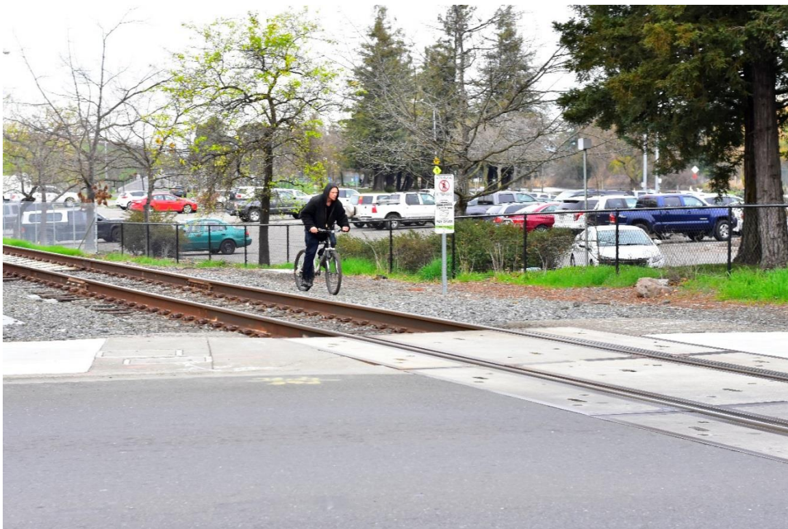
Trespasser riding right past the no trespassing signs in Rohnert Park.