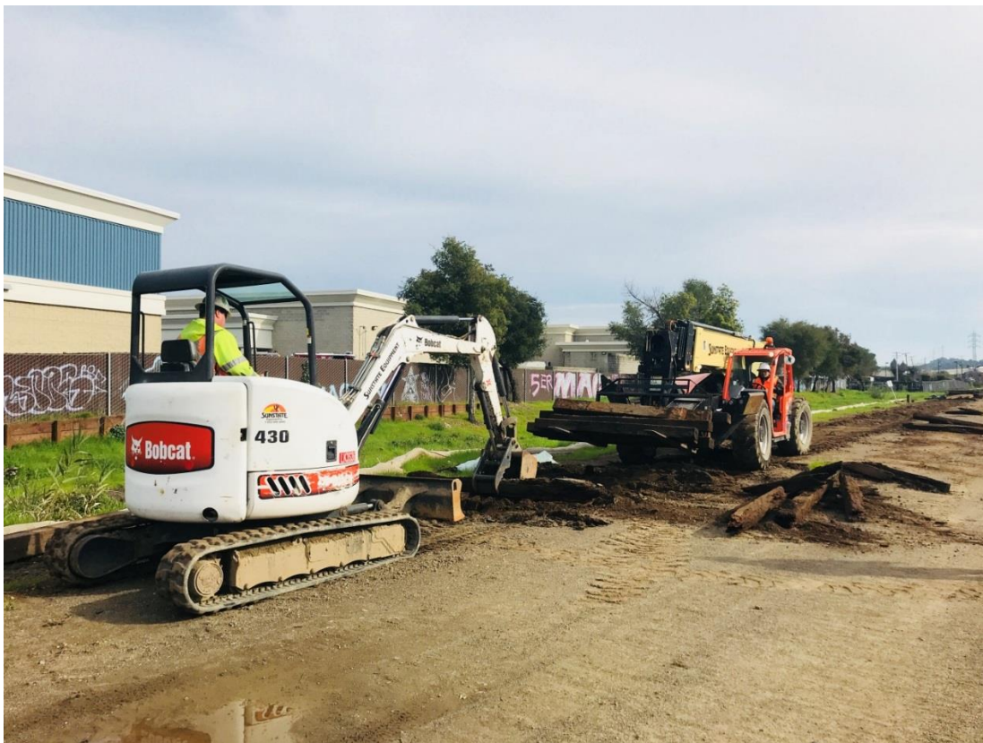
Tie removal north of Andersen Drive