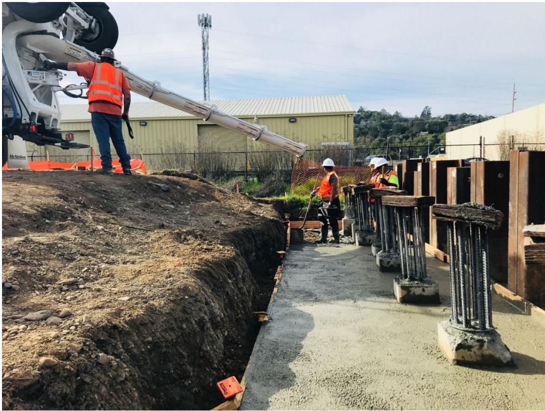
Bridge abutment construction near Rice Drive.