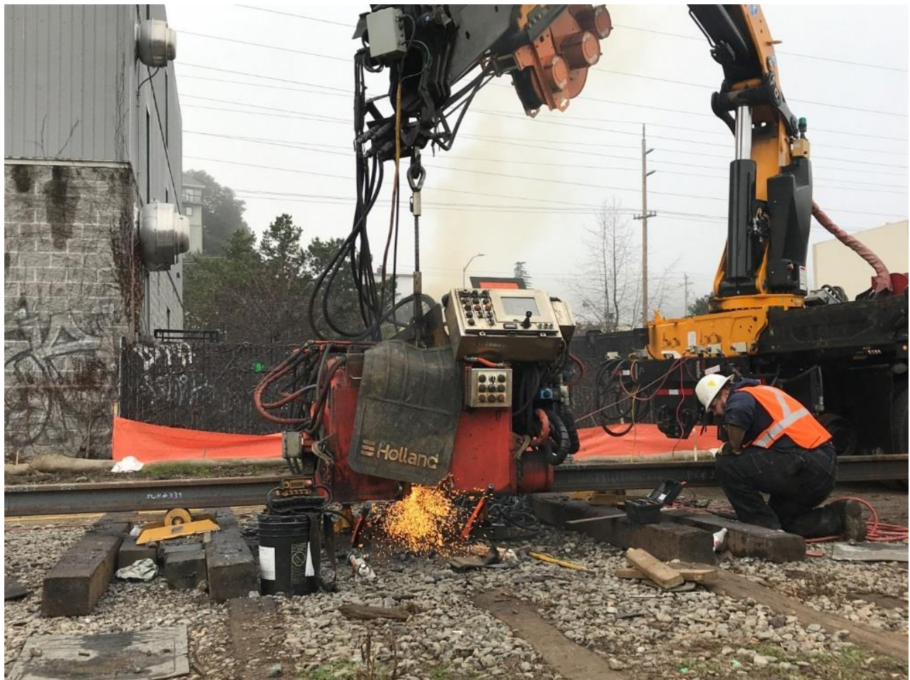
Rail welding to prepare long “strings” of rail.