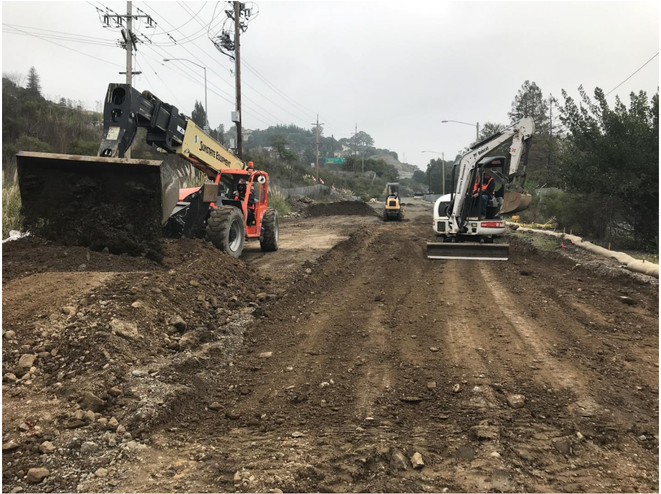
Work for the Larkspur Station platform is underway.