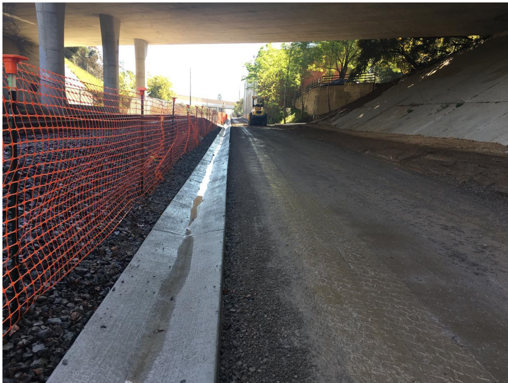
The pathway from Franklin to Grant is ready for paving, Novato