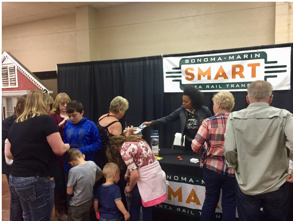
The SMART information booth was a popular stop at the Cloverdale Citrus Fair