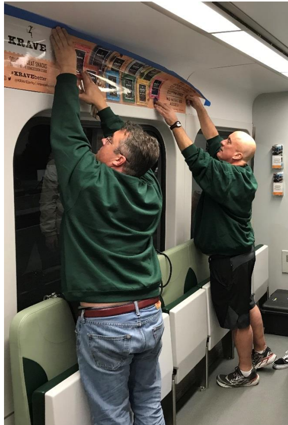
Professional installers placing a new ad on a rail car

Advertising space on SMART trains continue to be popular with businesses. Ad sales are strong and most of SMART's advertisers tend to renew their ads. We are also continuing to bring new advertisers into the mix, with advertising space booked well into 2018.