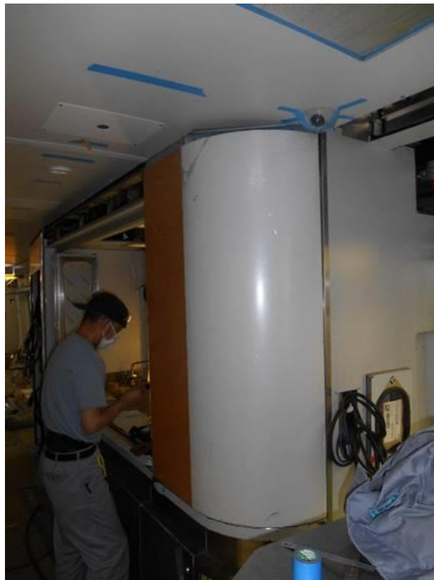
Car 117: Service Bar nearing completion