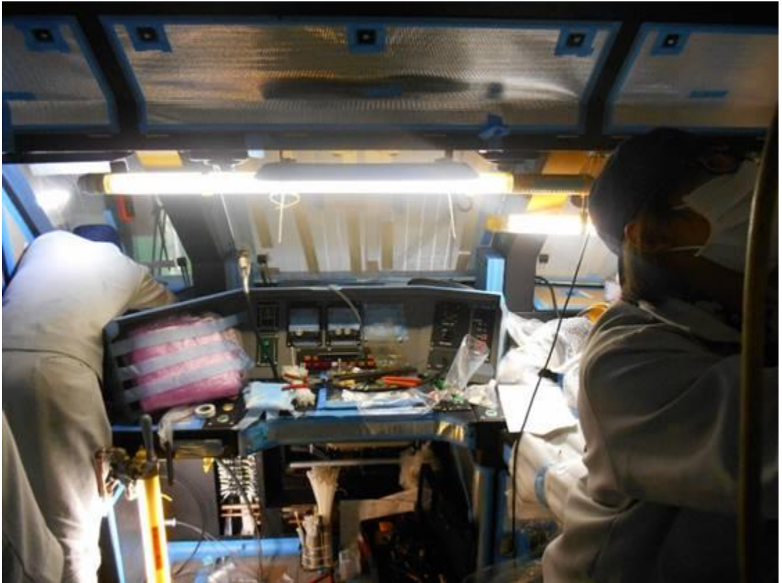
Car 115: Final Components of Cab being installed