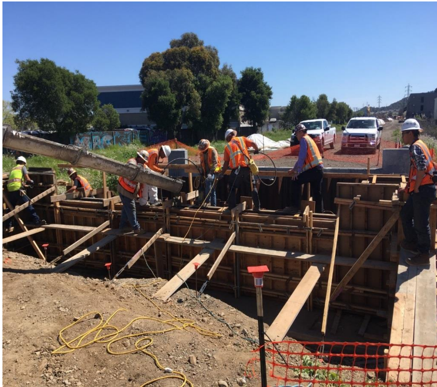
Concrete placement for the north bridge abutment at the Unnamed Channel