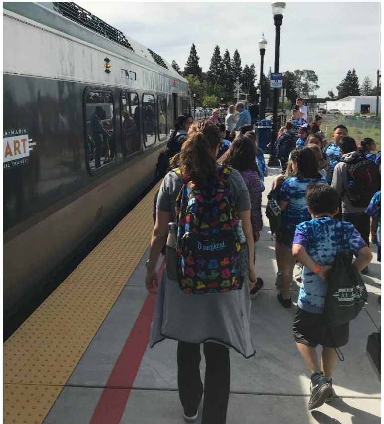
Students from Loma Vista Immersion Academy (pictured at left) recently made the SMART train part of their field trip from Petaluma to downtown Santa Rosa. The group received a safety briefing before starting their trip.

SMART's community outreach team also conducted a wave of safety canvassing in advance of the start of overnight testing for freight operator Northwestern Pacific Railroad Company's Positive Train Control system. This included the Sheraton Hotel in Petaluma, located near areas where the train horn would frequently sound during testing times.