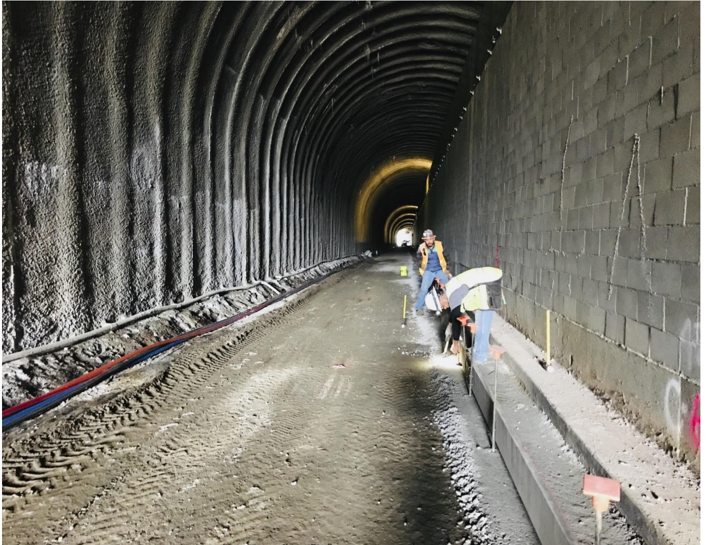
Cal Park Tunnel grading work