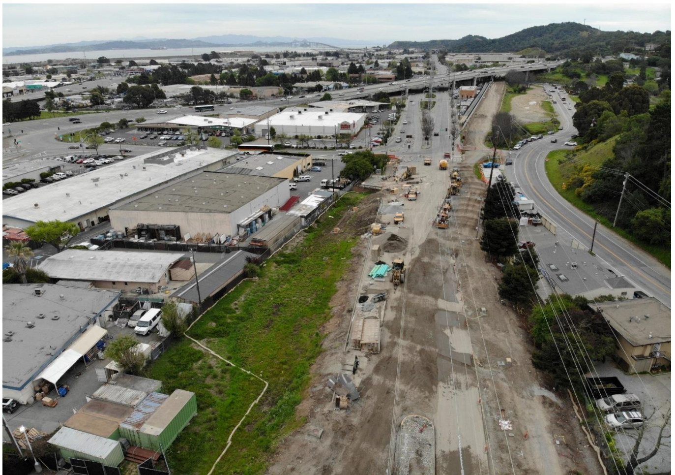
Aerial view of Andersen Drive Construction