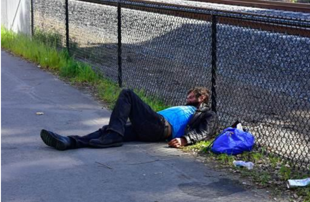
A transient was contacted on the bike path and asked to move along in Santa Rosa

Staff participated in the monthly Transportation Security Administration Surface Transportation call. SMART was provided with a security intelligence briefing regarding surface transportation trends and a technology update on available systems for surface transportation.