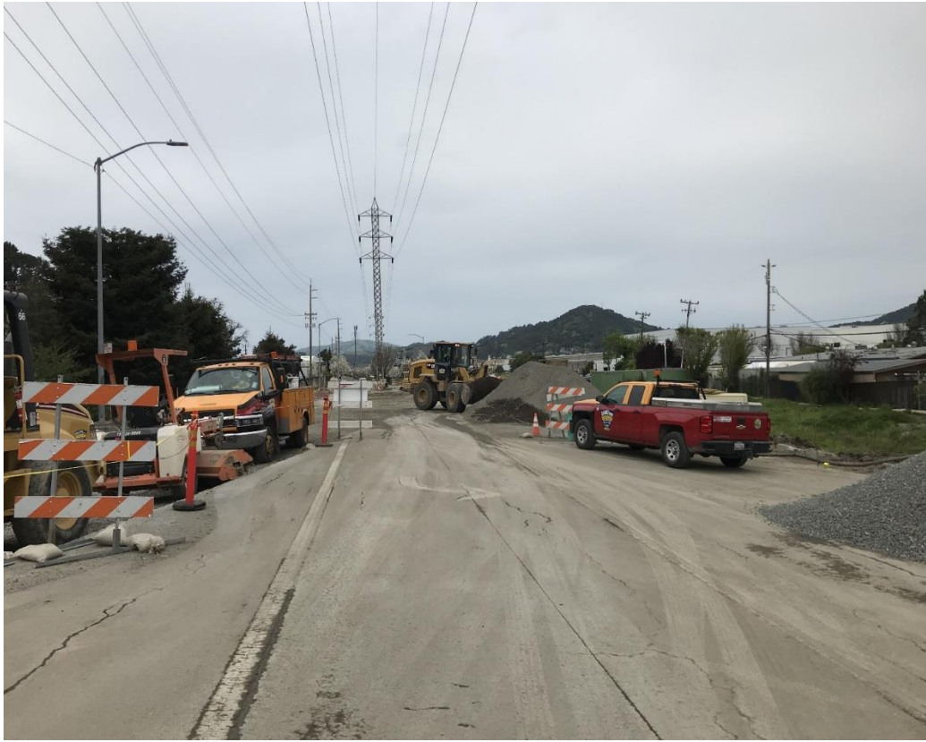
Andersen Drive construction