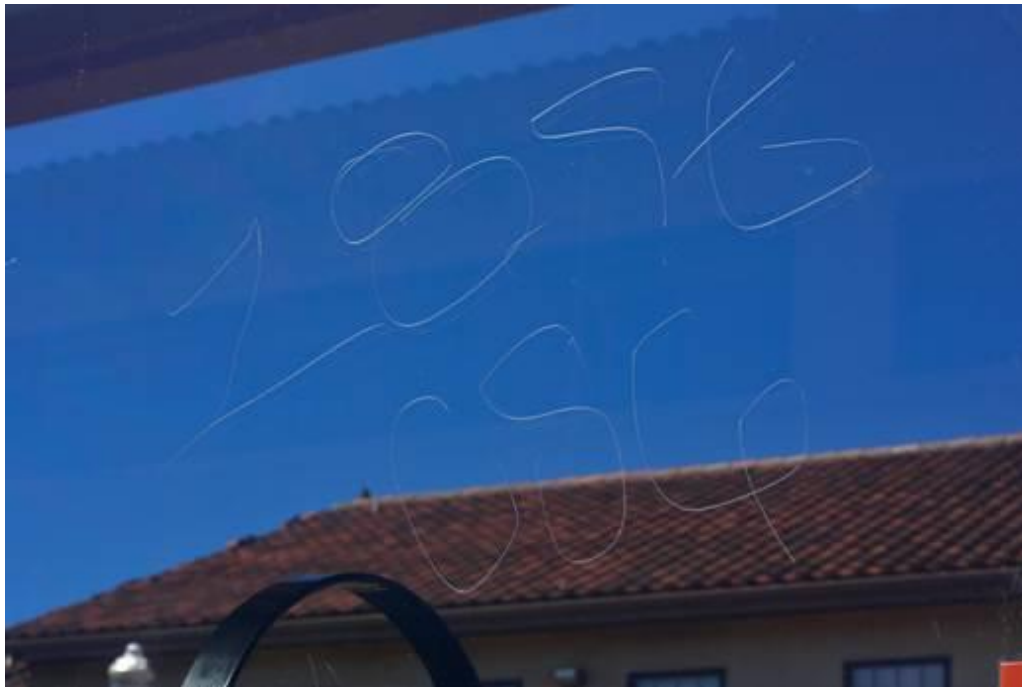
Suspects etched in the glass at Downtown San Rafael station, the tagging