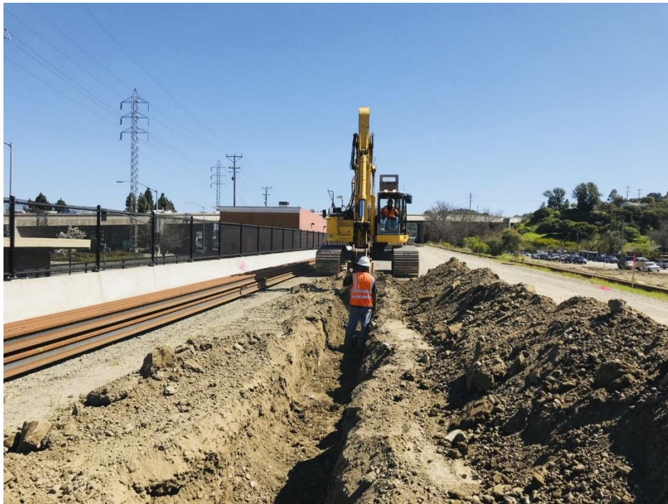
Ductbak Installation between Auburn Street and Andersen Drive