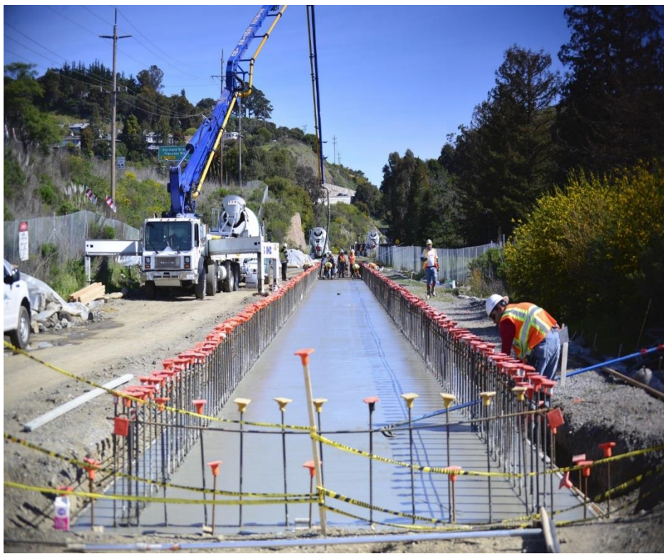
Larkspur station Platform construction