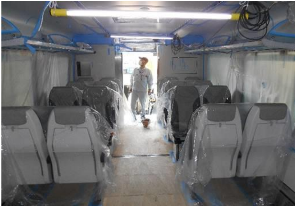
Car 116: All seats have been installed throughout the vehicle